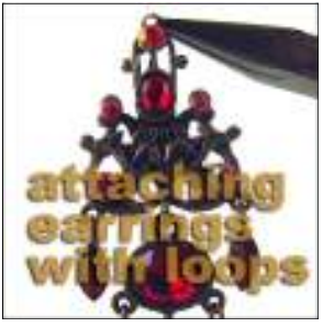
Choosing the correct Clip for your earrings