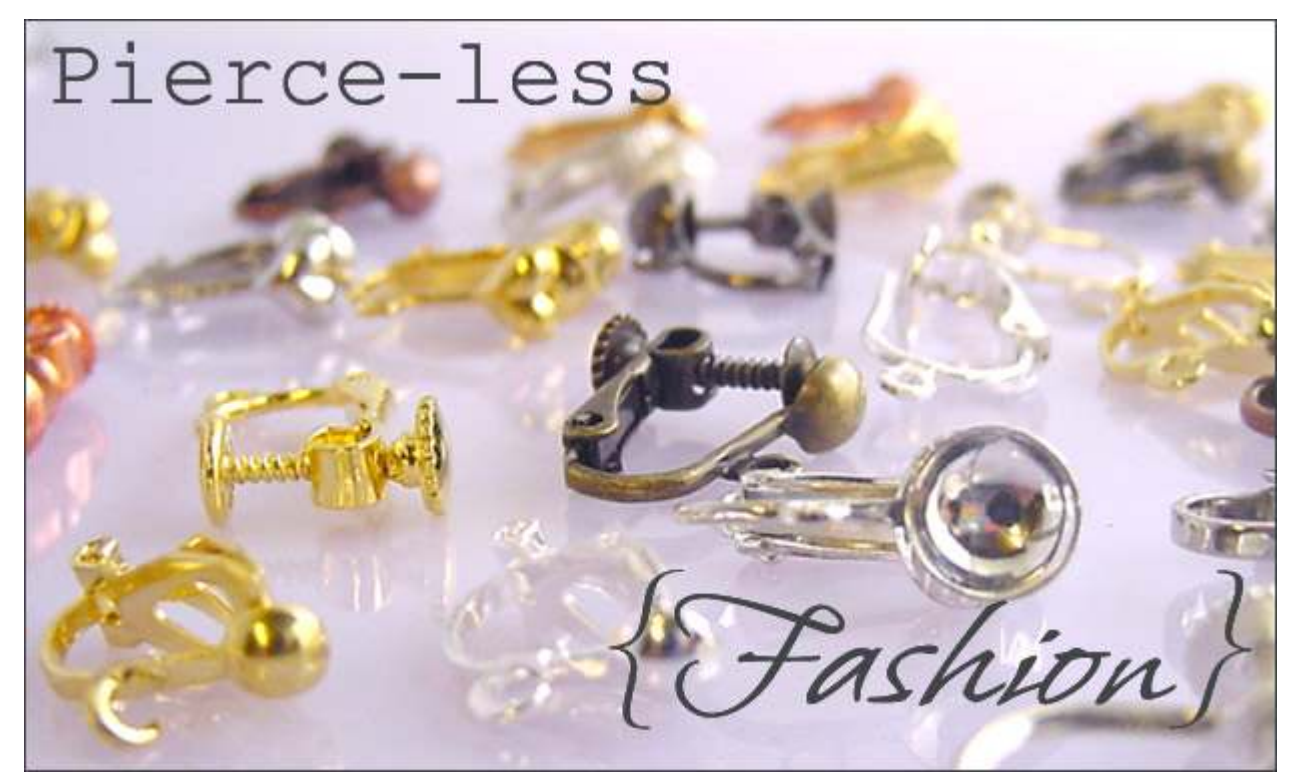
Working with clip earring closures

I hope with this technique you will feel comfortable attaching earrings to clips findings.