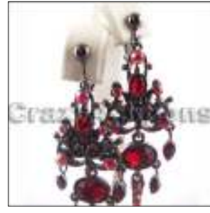
<u>Attaching earrings with</u> <u>a top loop to clip with</u> <u>hoops.</u>

Choose the correct color hue To keep uniformity and consistency in looks, choose the closest metal hue that is used on your earrings.